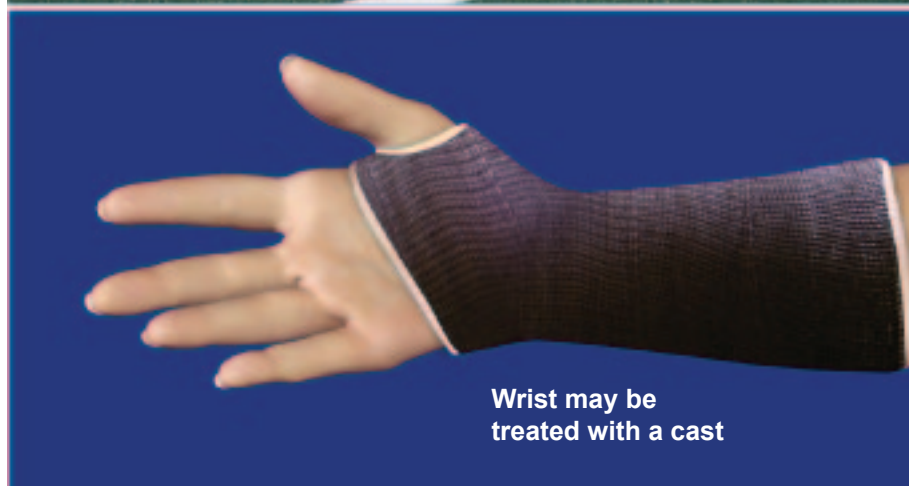
Wrist may be treated with a cast